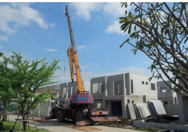
Prefabricated house in shell

In the industry, there is sometimes discussion of low productivity in the construction sector, i.e., this issue is well known, but not much has been done to change this situation so far. 3D printers for the construction site are being developed to increase productivity. 3D printers are a creative development, but they do not make the construction process significantly more productive, because again only a part of the system is considered and not the whole system. There is also the question of whether contractors are even aiming for a more productive construction process, because currently most of the work is done by the contractors.